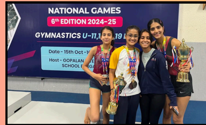
Representations at competitions (pan India)